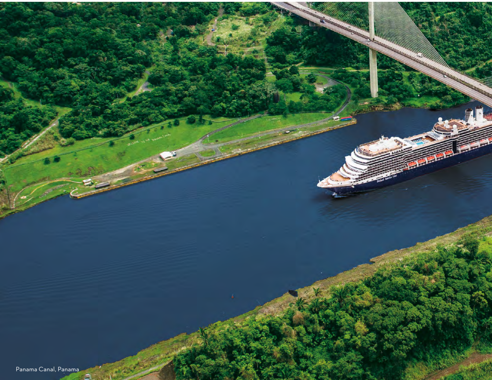
Panama Canal, Panama