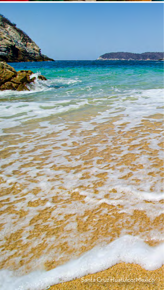
Santa Cruz Huatulco, Mexico