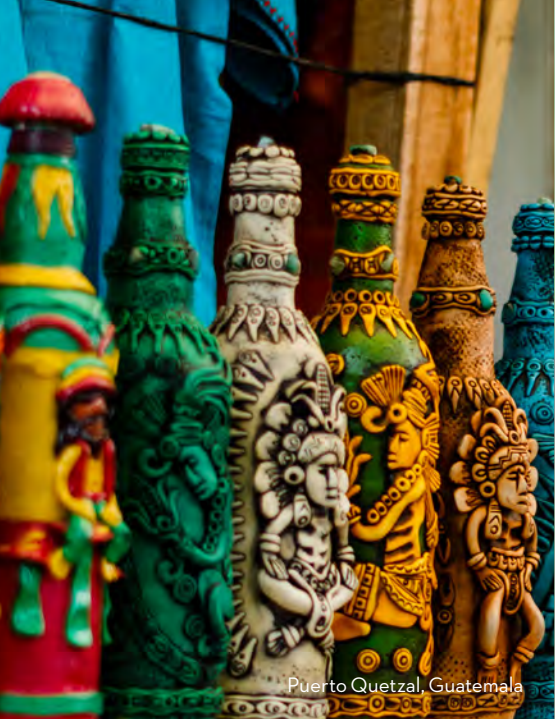
Puerto Quetzal, Guatemala